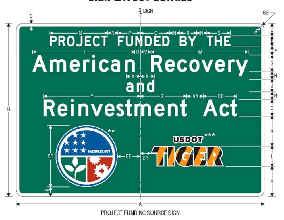
NOTE: SIGN SHALL NOT BE INSTALLED WITHOUT PROJECT FUNDING SOURCE PLAQUE