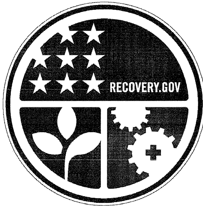
RECOVERY Vector-Based, Vinyl-Ready Pictograph

COLORS: LEGEND, OUTLINE - WHITE (RETROREFLECTIVE) BORDER - BLUE (RETROREFLECTIVE) BACKGROUND (UPPER) - BLUE (RETROREFLECTIVE) BACKGROUND (LOWER RIGHT) - RED (RETROREFLECTIVE) BACKGROUND (LOWER LEFT) - GREEN (RETROREFLECTIVE)