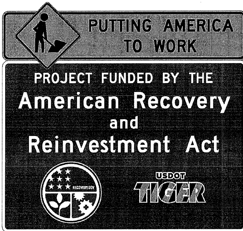
PROJECT FUNDING SOURCE SIGN ASSEMBLY