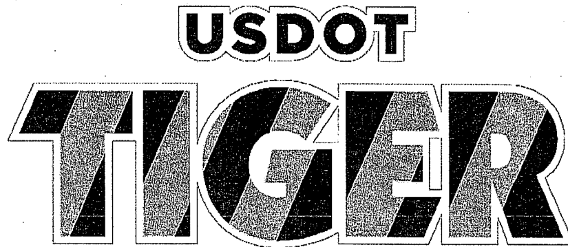
USDOT TIGER Vector-Based, Vinyl-Ready Pictograph

COLORS: OUTLINE - WHITE (RETROREFLECTIVE) USDOT LEGEND - BLACK TIGER DIAGONALS - BLACK, ORANGE (RETROREFLECTIVE)