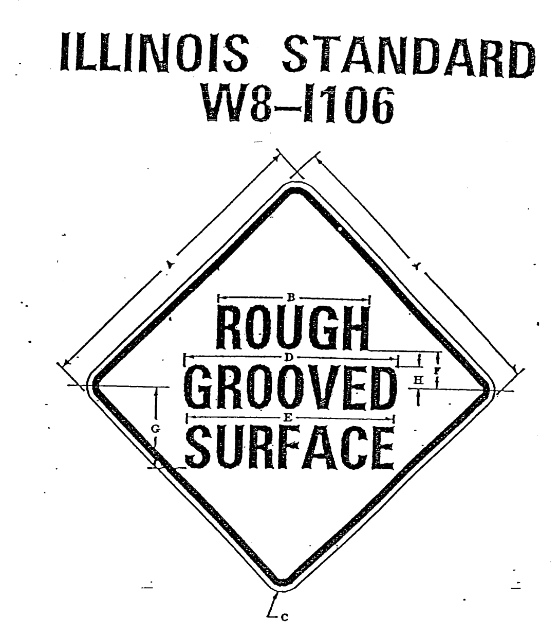
COLOR: LEGEND AND BORDER ---- BLACK NON-REFLECTORIZED BACKGROUND ------ ORANGE REFLECTORIZED