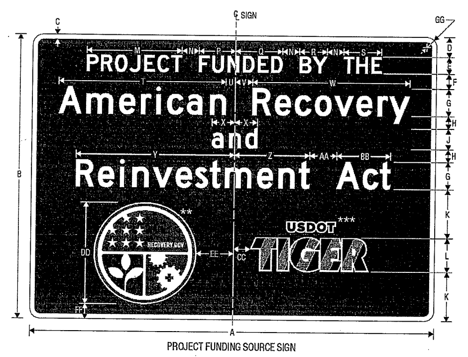
NOTE: SIGN SHALL NOT BE INSTALLED WITHOUT PROJECT FUNDING SOURCE PLAQUE