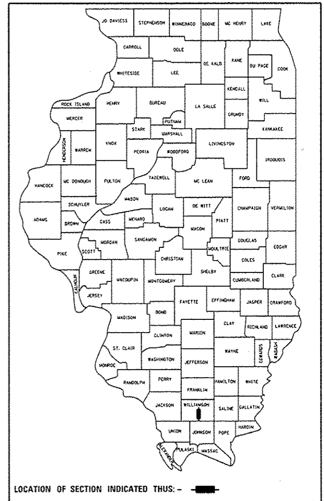
LOCATION OF SECTION INDICATED THUS: - [shaded rectangle] -