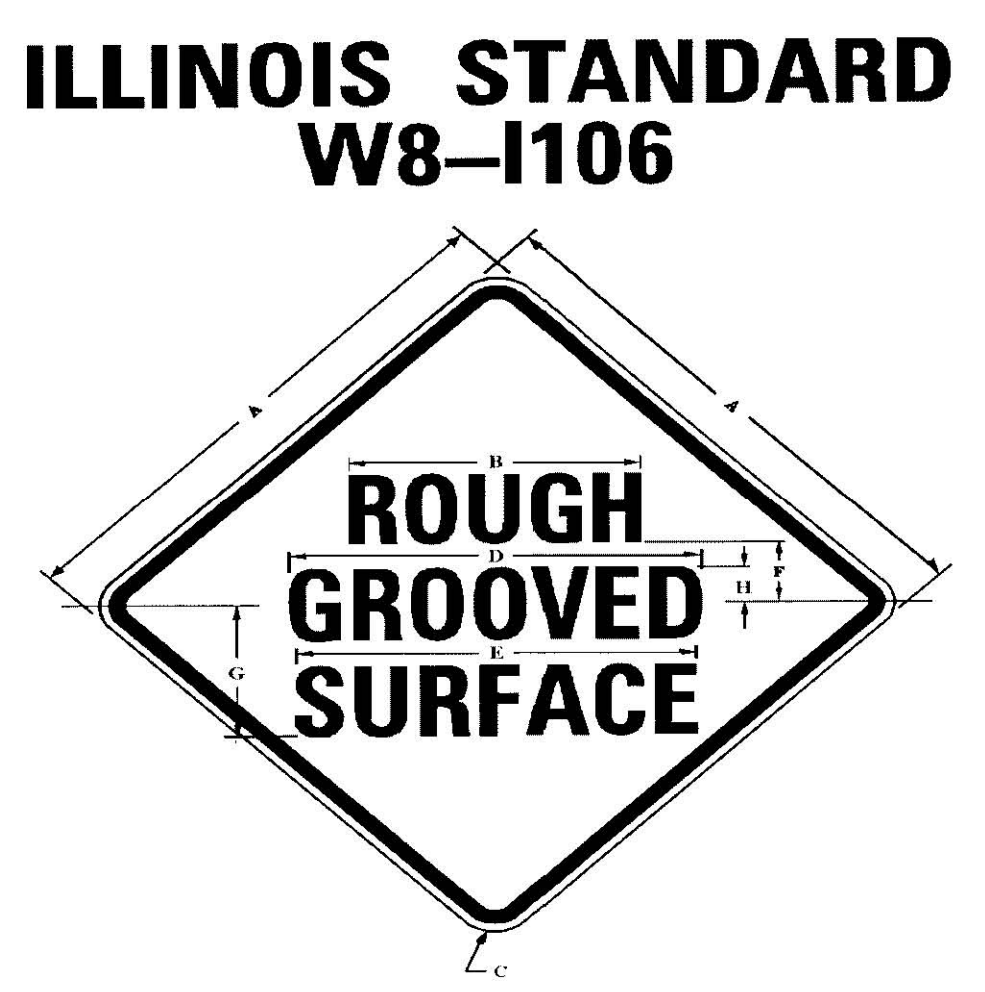
COLOR: LEGEND AND BORDER — BLACK NON-REFLECTORIZED BACKGROUND — ORANGE REFLECTORIZED

At the end of each day's work, temporary pavement marking line shall be in place on the planed surface in accordance with Section 703 of the Standard Specifications.