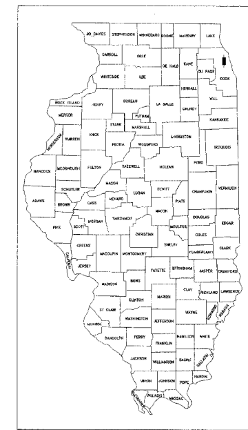
LOCATION OF SECTION INDICATED THUS:

PROJECT LOCATED IN THE VILLAGE OF MAYWOOD