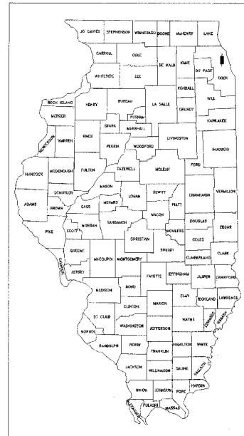
LOCATION OF SECTION INDICATED THUS: