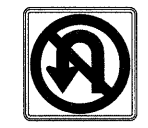
24" X 24" METAL POST TYPE-B R3-4