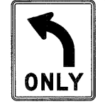
24" X 30" METAL POST TYPE-B R3-5L