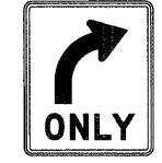
24" X 30" METAL POST TYPE-B R3-5R

McDonough Associates Inc. Engineers / Architects 130 East Randolph Street, Chicago, Illinois 60601