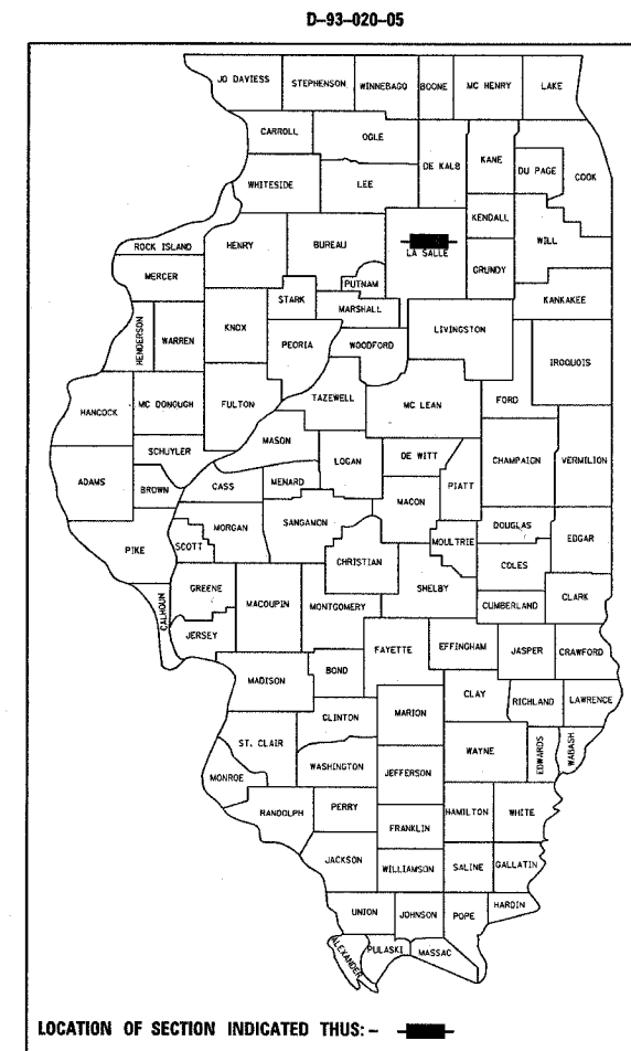
LOCATION OF SECTION INDICATED THUS: - [Black Box] -

NET AND GROSS LENGTH = 48.5 FT ALONG CENTERLINE OF MEDIAN PIER