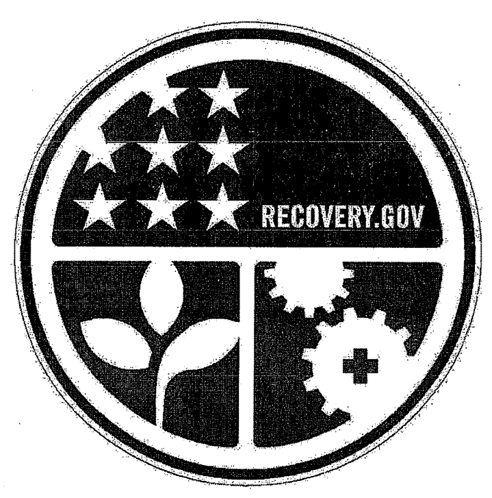
RECOVERY Vector-Based, Vinyl-Ready Pictograph

COLORS: LEGEND, OUTLINE - WHITE (RETROREFLECTIVE) BORDER - BLUE (RETROREFLECTIVE) BACKGROUND (UPPER) - BLUE (RETROREFLECTIVE) BACKGROUND (LOWER RIGHT) - RED (RETROREFLECTIVE) BACKGROUND (LOWER LEFT) - GREEN (RETROREFLECTIVE)