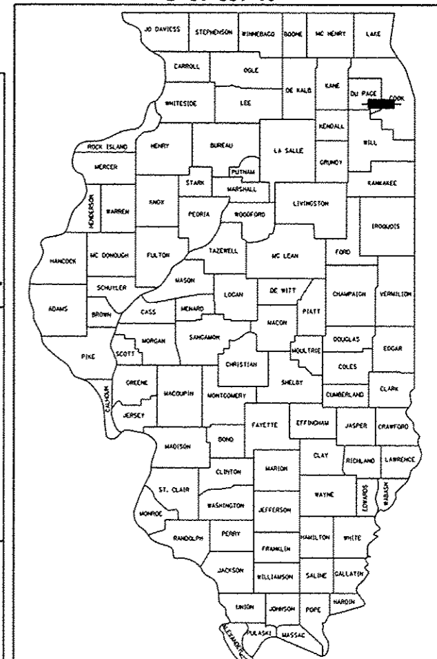
LOCATION OF SECTION INDICATED THIS: -