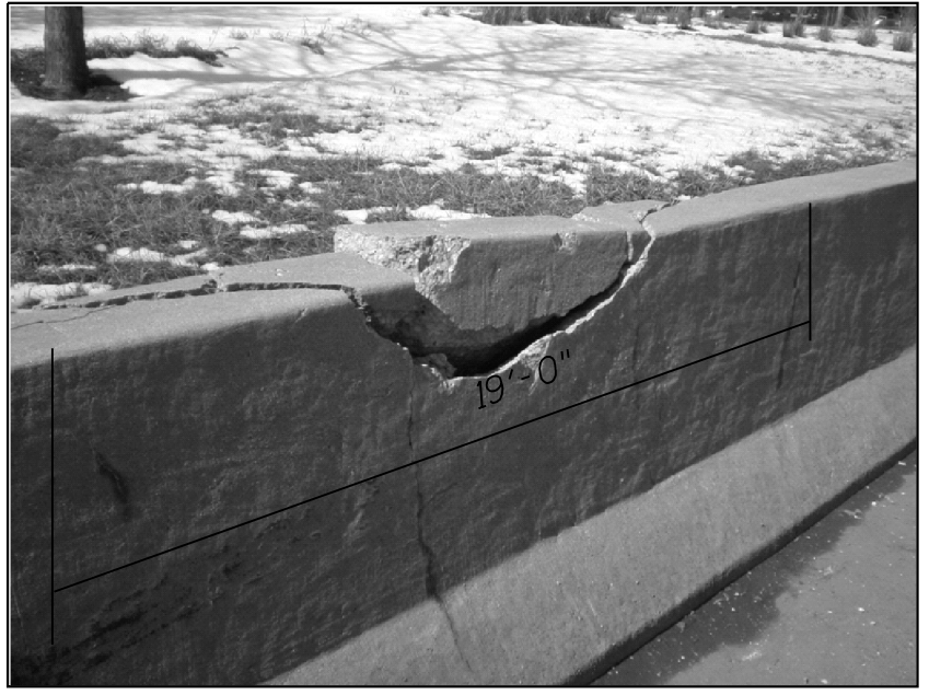
HALF DEPTH REPAIR REPLACE 19' OF BARRIER WALL FOR MORE DETAILS, SEE SHEET #6