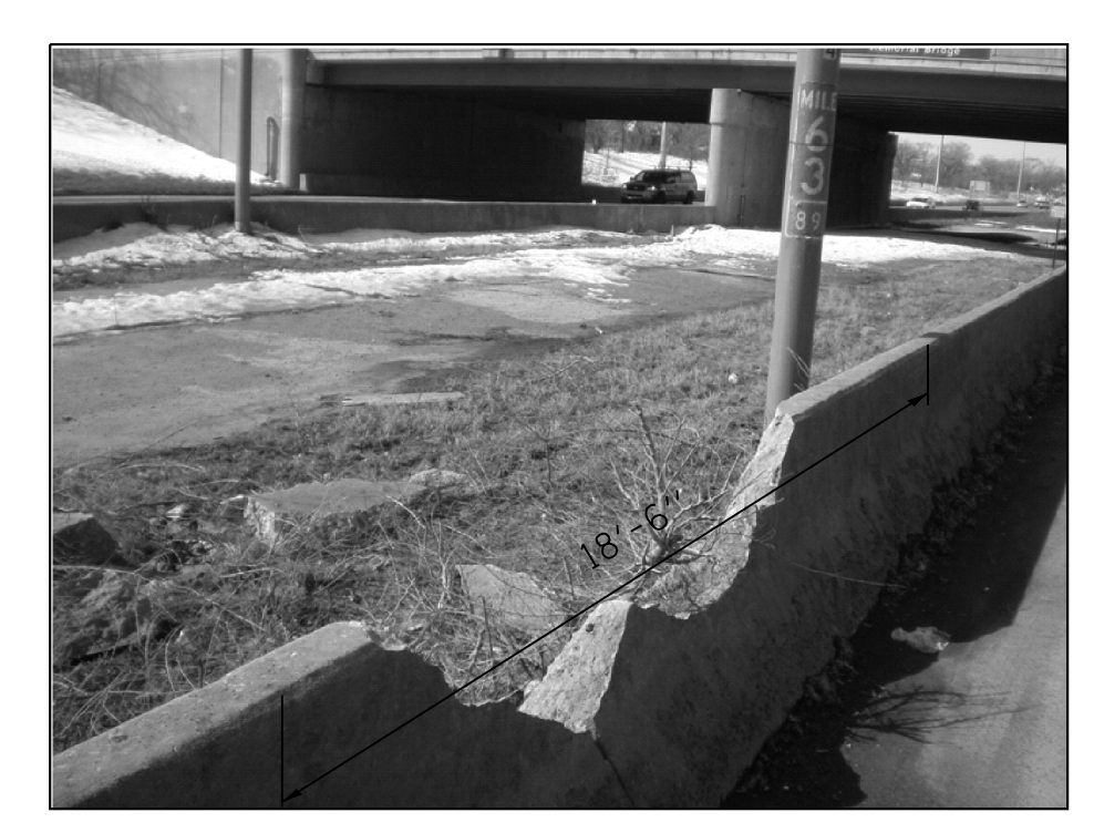
HALF DEPTH REPAIR REPLACE 18^{1}\!\!/_{2} of Barrier Wall FOR MORE DETAILS, SEE SHEET #6