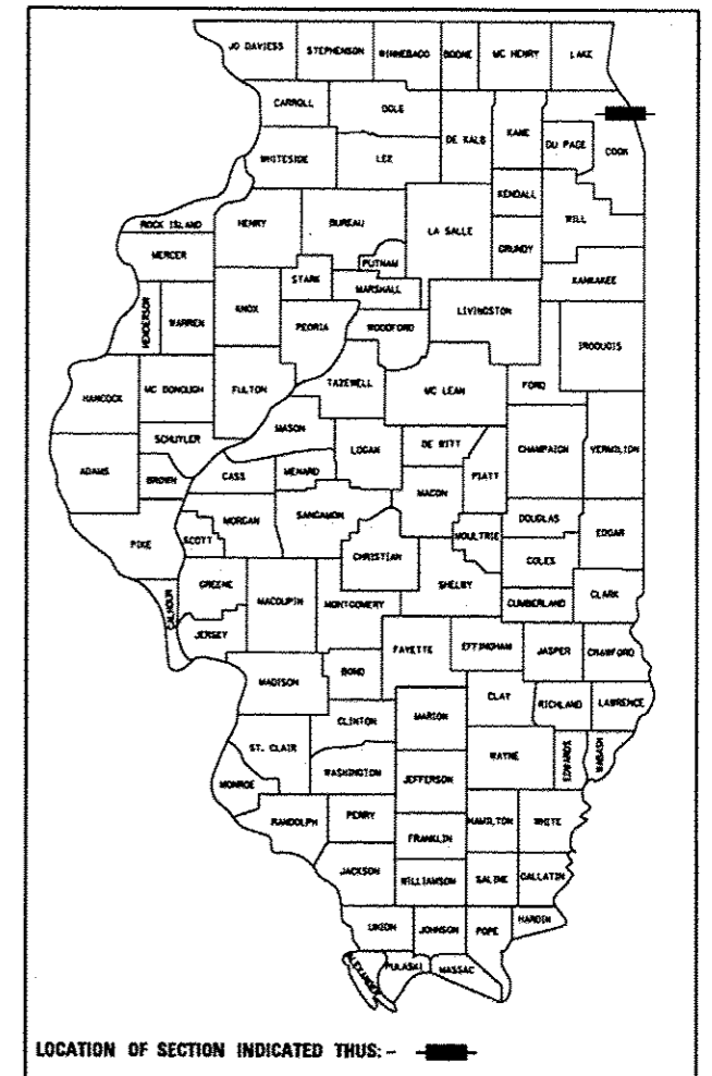
LOCATION OF SECTION INDICATED THUS: - ■ -

FAI ROUTE 90/94/290 (I-90/94/290) I-90/94 AT I-290 CIRCLE INTERCHANGE HALSTED/HARRISON ST WATERMAIN MATERIALS PROCUREMENT SECTION 2013-051T WATER MAIN MATERIALS COOK COUNTY C-91-048-14