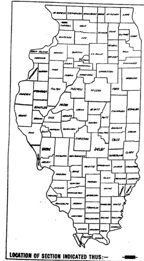
LOCATION OF SECTION INDICATED THUS:—