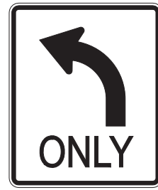
R3-5L 30" x 36" OR 24" x 30" (WHEN USED ON BACK OF R4-7) G