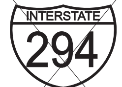
NOT USED M1-1 (I-294) 30" x 24" AE