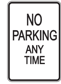
R7-1 12" x 18" S