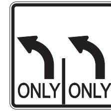
R3-8 (MODIFIED) 30" x 30" I