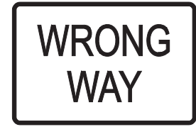
R5-1a 42" x 30" M