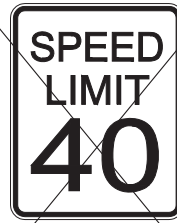
NOT USED R2-1 (40) 30" x 36" D