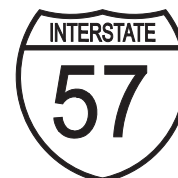
M1-1 (I-57) 24" x 24" AD