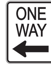
R2-6L 30" x 36" R