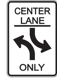
R3-9b 24" x 36" J