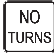
R3-3 36" x 36" F