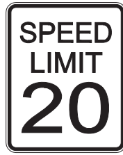
R2-1 (20) 30" x 36" B