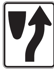
R4-7 24" x 30" K