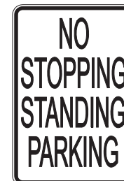
R8-6 (MODIFIED) 24" x 30" U