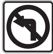
R3-2 36" x 36" OR 24" x 24" AT DRIVEWAY E