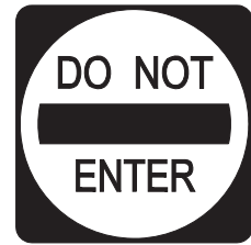
R5-1 36" x 36" L