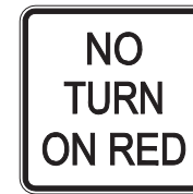
R10-11b 24" x 24" X