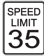
R2-1 (35) 30" x 36" C