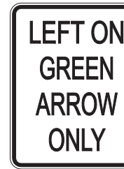
R10-5 30" x 36" W