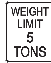
R12-1 24" x 30" Y