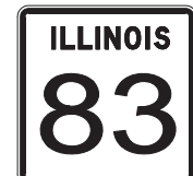
M1-1100 24" x 24" OR 36" x 36" (WHEN USED WITH M2-1) AF