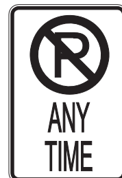
R8-3a 12" x 18" V