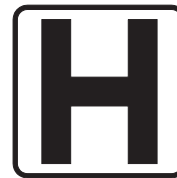
D9-2 24" x 24" AB