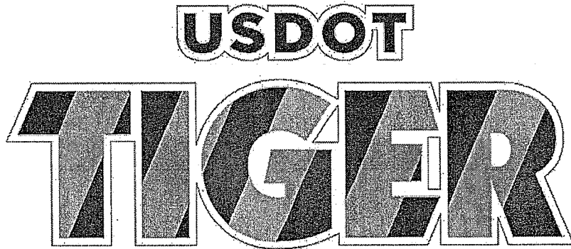
USDOT TIGER Vector-Based, Vinyl-Ready Pictograph

COLORS: OUTLINE -- WHITE (RETROREFLECTIVE) USDOT LEGEND -- BLACK TIGER DIAGONALS -- BLACK, ORANGE (RETROREFLECTIVE)