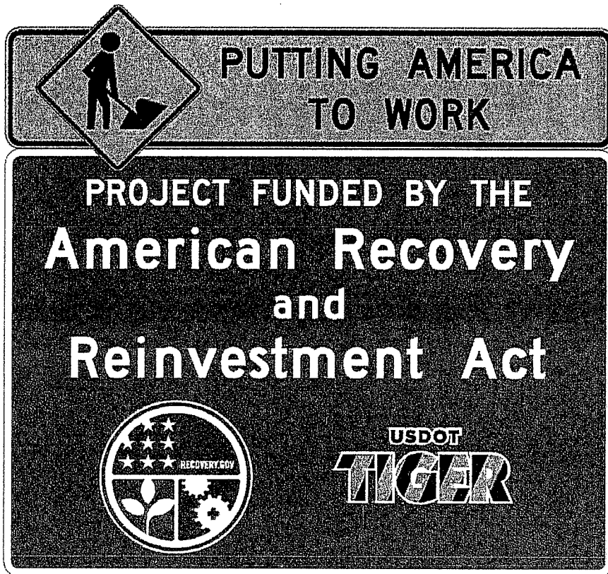
PROJECT FUNDING SOURCE SIGN ASSEMBLY