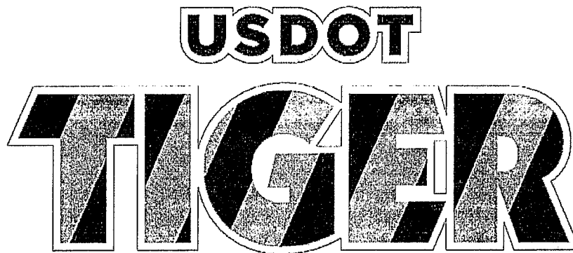
USDOT TIGER Vector-Based, Vinyl-Ready Pictograph

COLORS: OUTLINE — WHITE (RETROREFLECTIVE) USDOT LEGEND — BLACK TIGER DIAGONALS — BLACK, ORANGE (RETROREFLECTIVE)