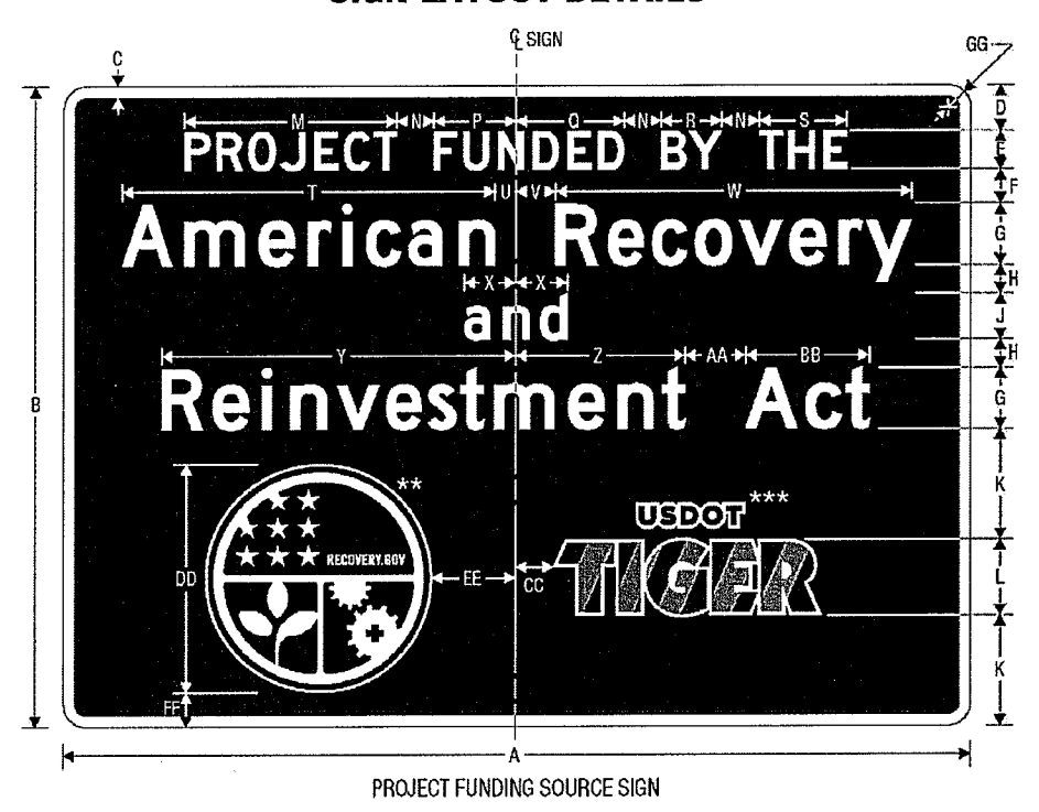
NOTE: SIGN SHALL NOT BE INSTALLED WITHOUT PROJECT FUNDING SOURCE PLAQUE