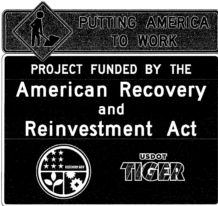
PROJECT FUNDING SOURCE SIGN ASSEMBLY