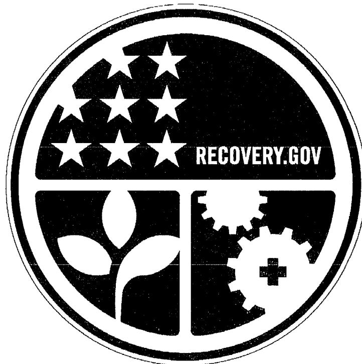
RECOVERY Vector-Based, Vinyl-Ready Pictograph