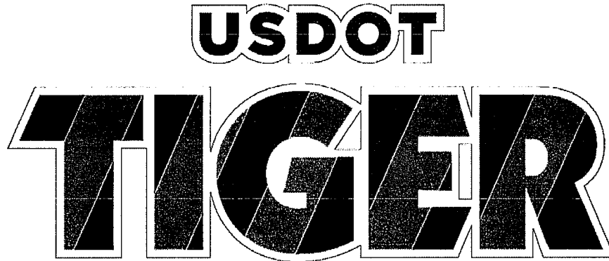
USDOT TIGER Vector-Based, Vinyl-Ready Pictograph

COLORS: OUTLINE -- WHITE (RETROREFLECTIVE) USDOT LEGEND -- BLACK TIGER DIAGONALS -- BLACK, ORANGE (RETROREFLECTIVE)