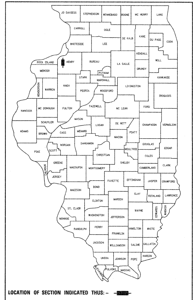
LOCATION OF SECTION INDICATED THUS: - [shaded area] -