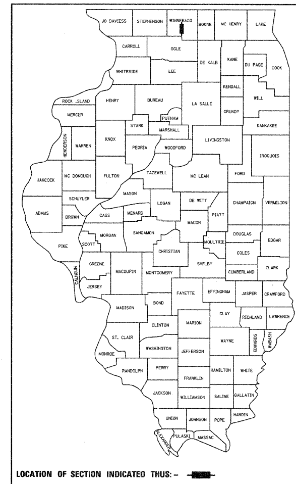
LOCATION OF SECTION INDICATED THUS: - [Symbol]