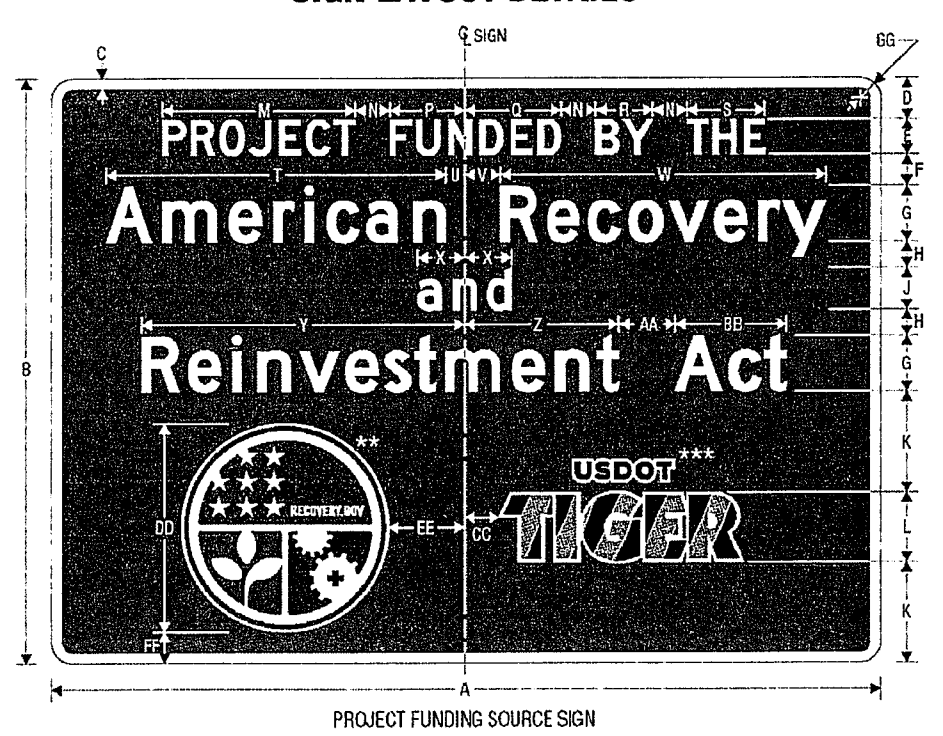
NOTE: SIGN SHALL NOT BE INSTALLED WITHOUT PROJECT FUNDING SOURCE PLAQUE