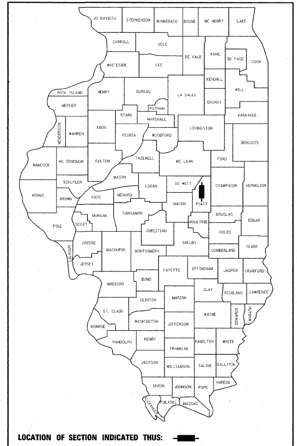
LOCATION OF SECTION INDICATED THUS: [Black Box]

Richard D. Payne DATE: 07/13/09 ILLINOIS PROFESSIONAL LICENSE NO. 37421 (EXPIRATION DATE: 11-30-09)