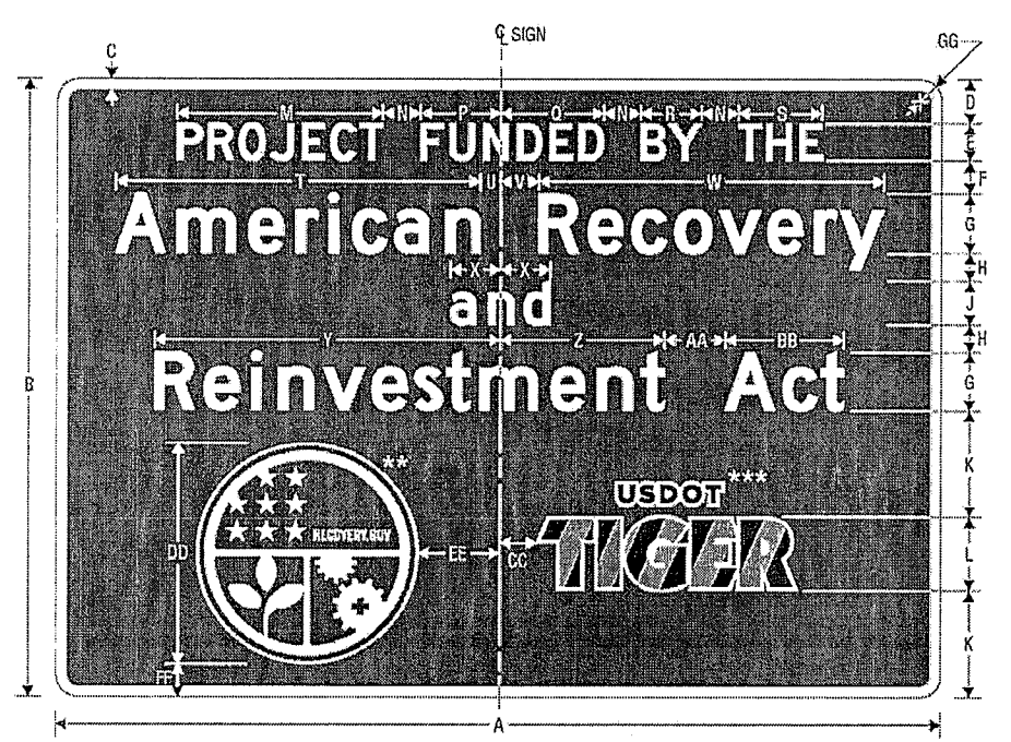
PROJECT FUNDING SOURCE SIGN

NOTE: SIGN SHALL NOT BE INSTALLED WITHOUT PROJECT FUNDING SOURCE PLAQUE