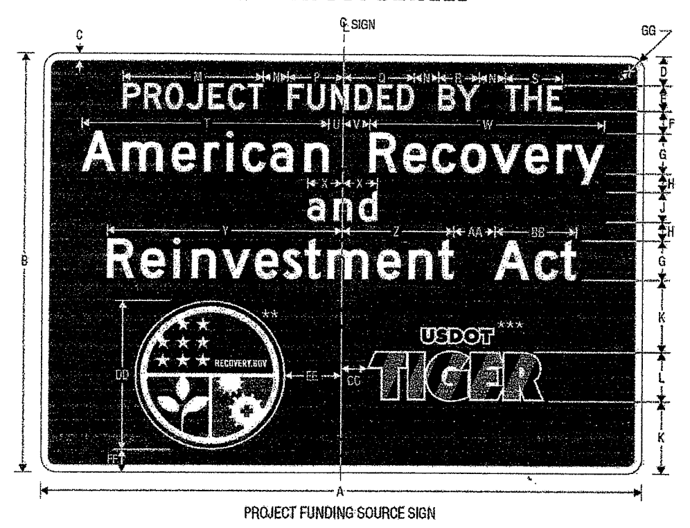
NOTE: SIGN SHALL NOT BE INSTALLED WITHOUT PROJECT FUNDING SOURCE PLAQUE