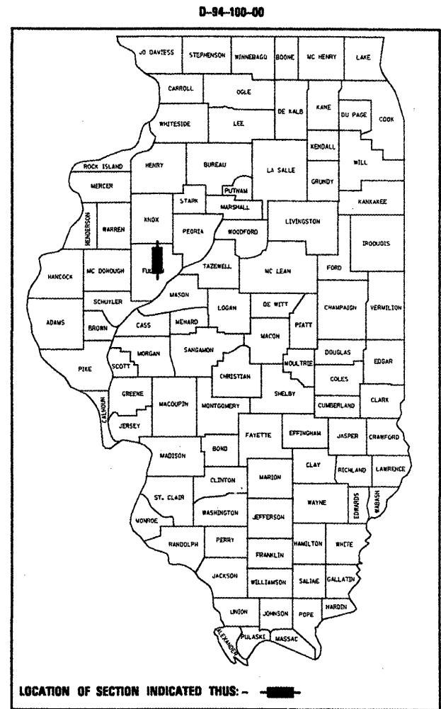
LOCATION OF SECTION INDICATED THIS: -

GROSS LENGTH OF IMPROVEMENT = 12003 FEET = 2.27 MILES NET LENGTH OF IMPROVEMENT = 12003 FEET = 2.27 MILES