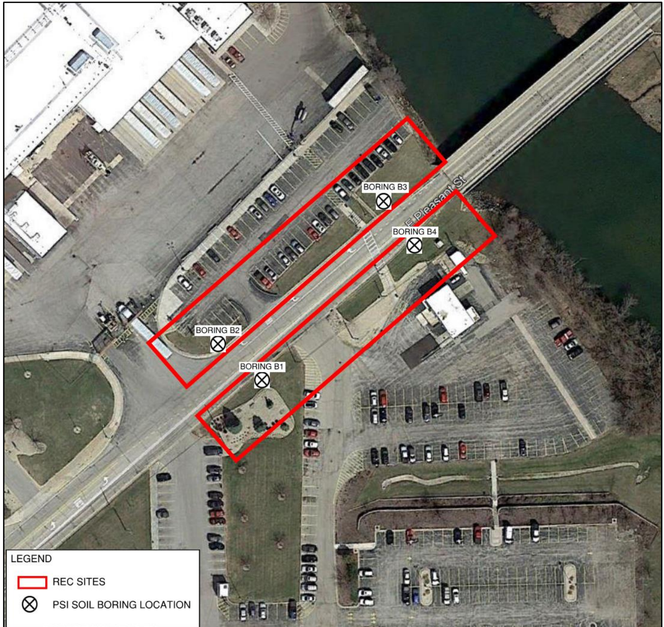
Figure 2 – Soil Boring Location Map