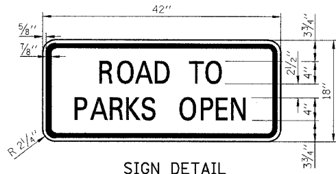
SIGN DETAIL SIGN PANEL - TYPE 1