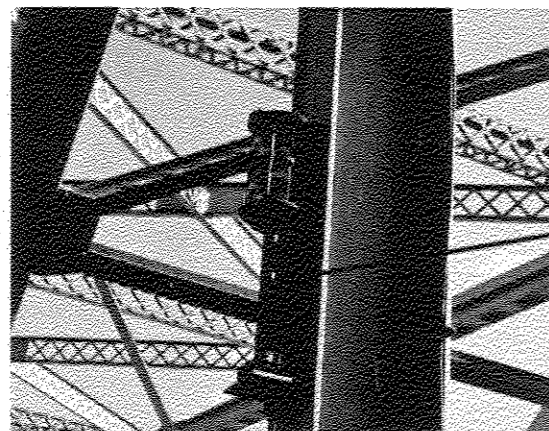
EXISTING NAVIGATION LIGHT (TYPICAL)

Replace Each White Navigation Light Assembly with LED Navigation Light Assemblies (see Construction Sequence on Sheet S12)