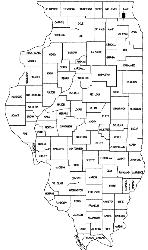
LOCATION OF SECTION INDICATED THIS: