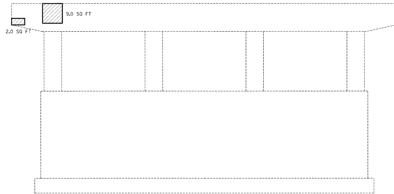
PIER #1 - WEST FACE