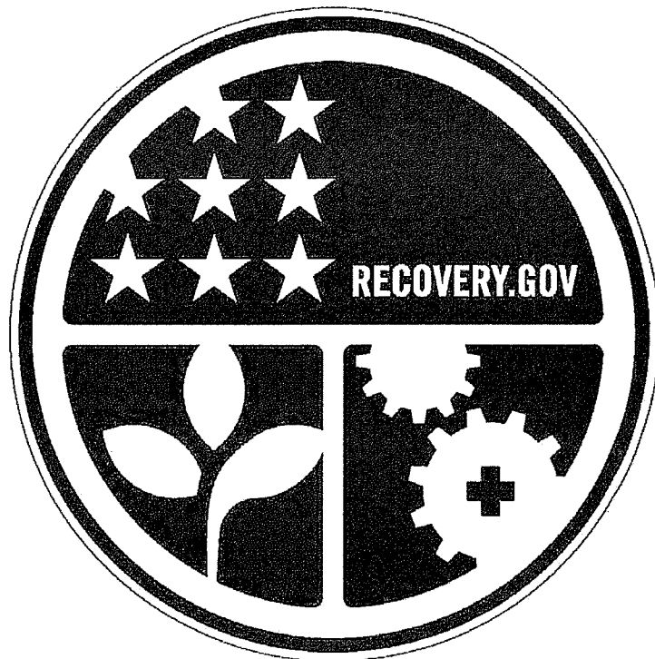
RECOVERY Vector-Based, Vinyl-Ready Pictograph

COLORS: LEGEND, OUTLINE - WHITE (RETROREFLECTIVE) BORDER - BLUE (RETROREFLECTIVE) BACKGROUND (UPPER) - BLUE (RETROREFLECTIVE) BACKGROUND (LOWER RIGHT) - RED (RETROREFLECTIVE) BACKGROUND (LOWER LEFT) - GREEN (RETROREFLECTIVE)