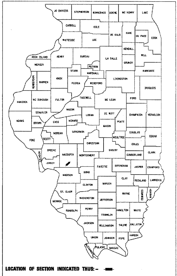
LOCATION OF SECTION INDICATED THUS: - ■ -