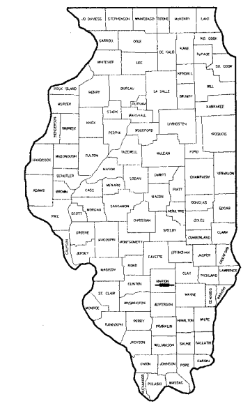
LOCATION OF PROJECT INDICATED THUS - - -