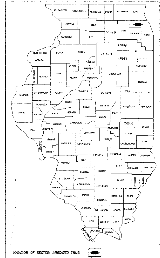
LOCATION OF SECTION INDICATED THIS:

GROSS AND NET LENGTH OF PROJECT = 4,260 FEET (0.807 MILES)