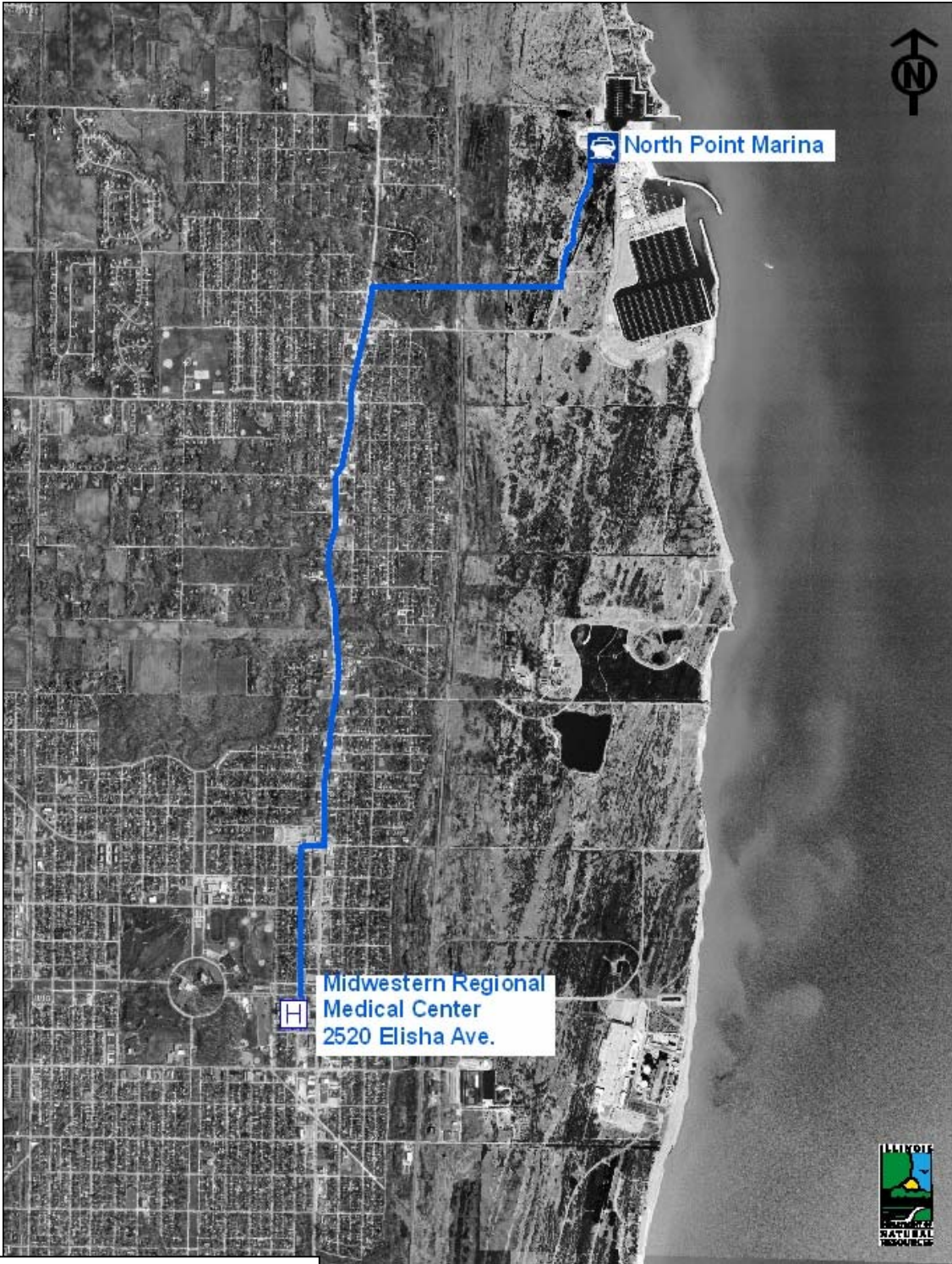
Route to Midwest Regional Medical Center From North Point Marina Zion, Illinois