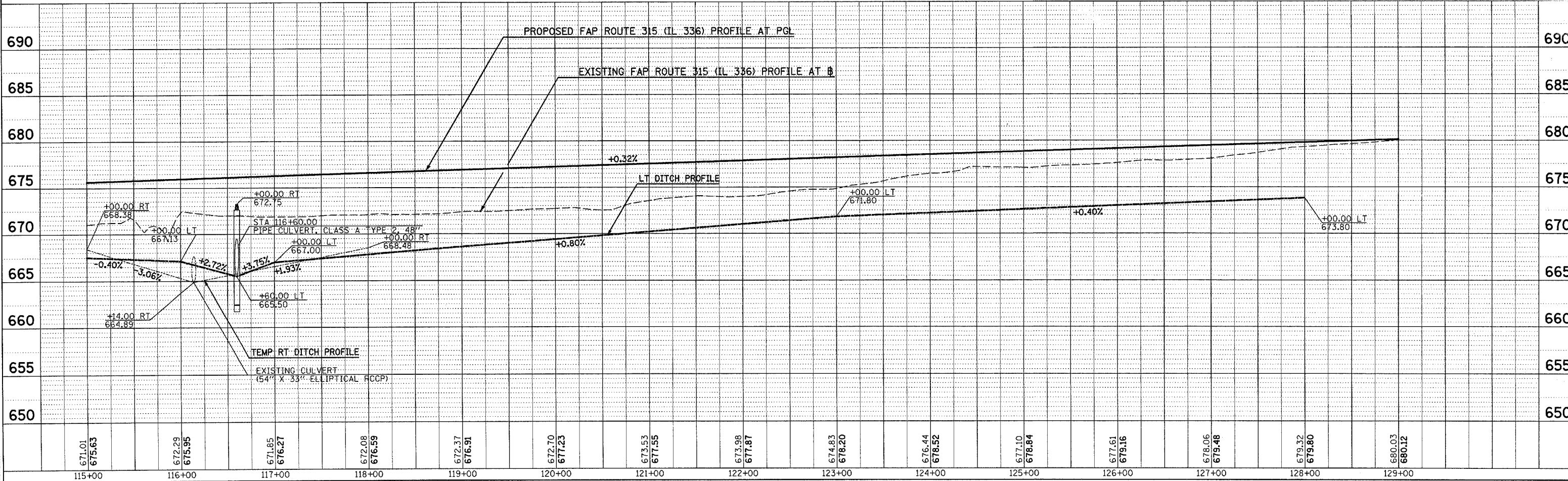
MAINTENANCE OF TRAFFIC (STAGE 1) PLAN & PROFILE - FAP ROUTE 315 (IL 336) STA 115+00 TO STA 129+00