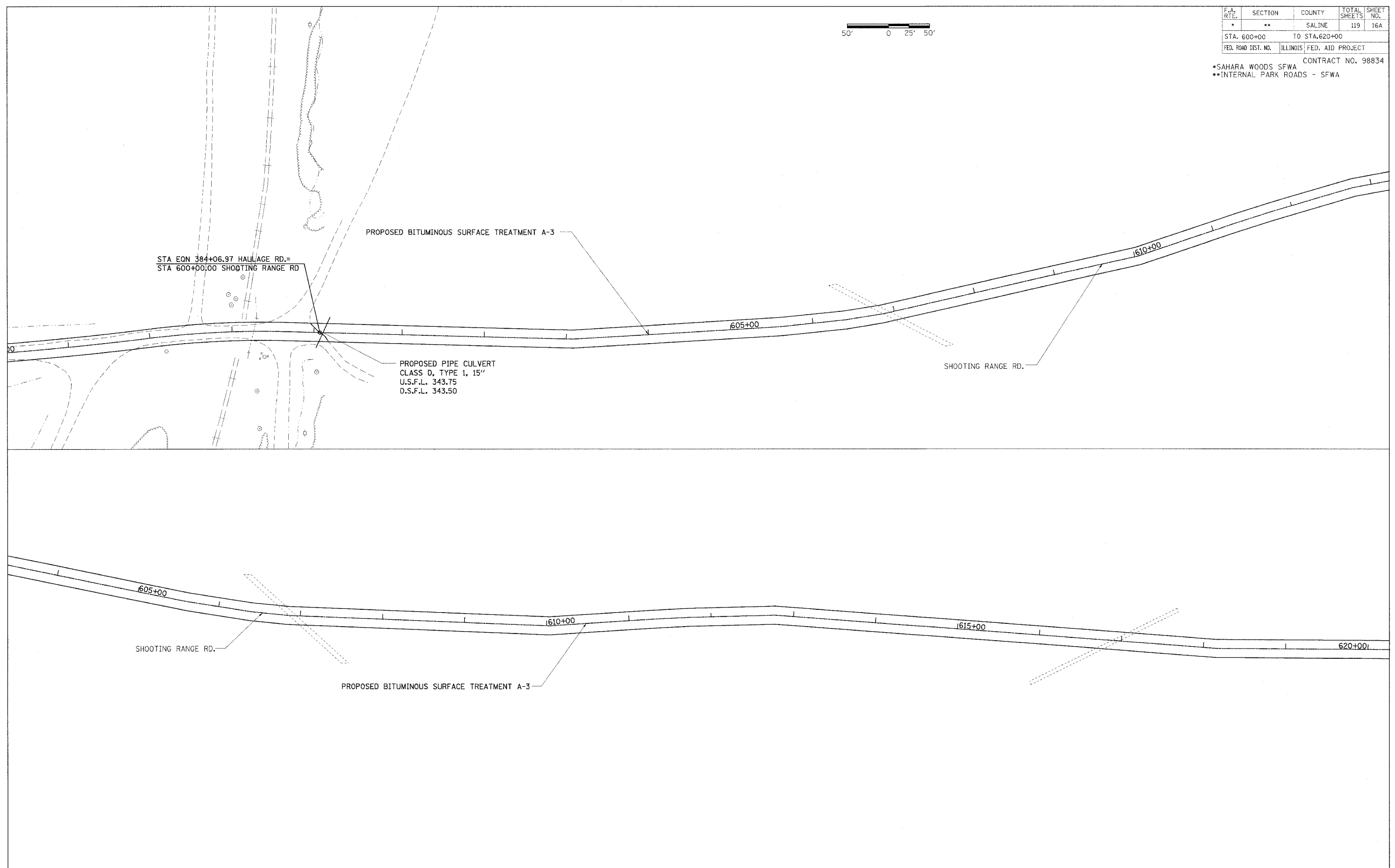
PLAN SHEET - SHOOTING RANGE RD. STA. 600+00 TO 620+00