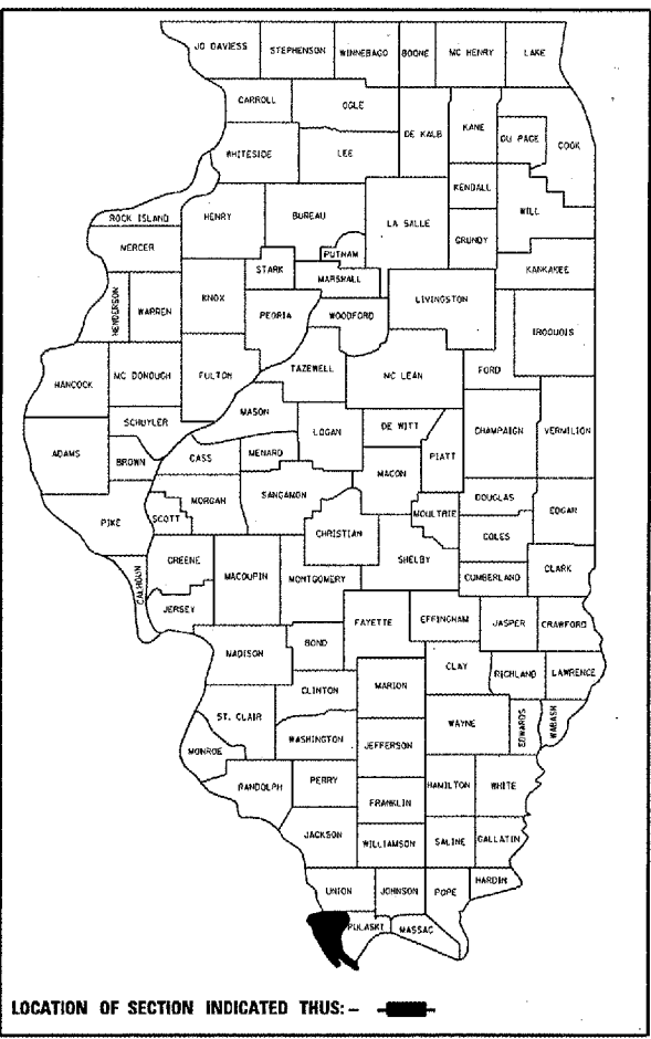
LOCATION OF SECTION INDICATED THUS: - ■ -

FAS ROUTE 944 (U.S. 60/62) SECTION (138D-BR) P-1 ALEXANDER COUNTY, ILLINOIS MISSISSIPPI COUNTY, MISSOURI C-99-002-06