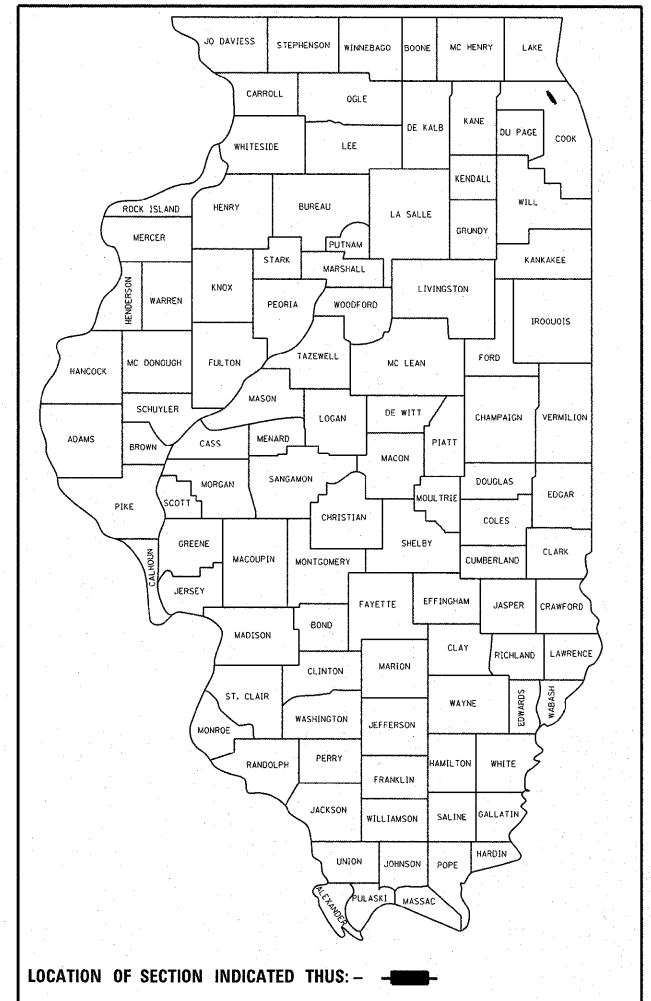
LOCATION OF SECTION INDICATED THUS: - [black rectangle] -