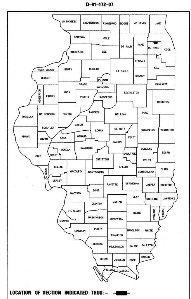
LOCATION OF SECTION INDICATED THIS: -

JEFFERSON SIDEWALK PROJECT ENDS STA. 44 + 94.35