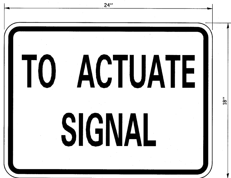
STOP LINE SIGN FOR TEMPORARY SIGNALS

SIZE: 24" x 18" 4" CAPITAL LETTERS - BLACK 1/2" BORDER - BLACK WHITE REFLECTIVE - TYPE B ENGINEERING GRADE SHEETING