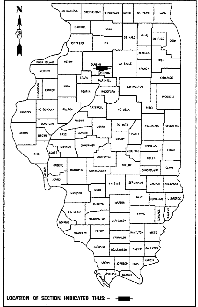
LOCATION OF SECTION INDICATED THUS: —