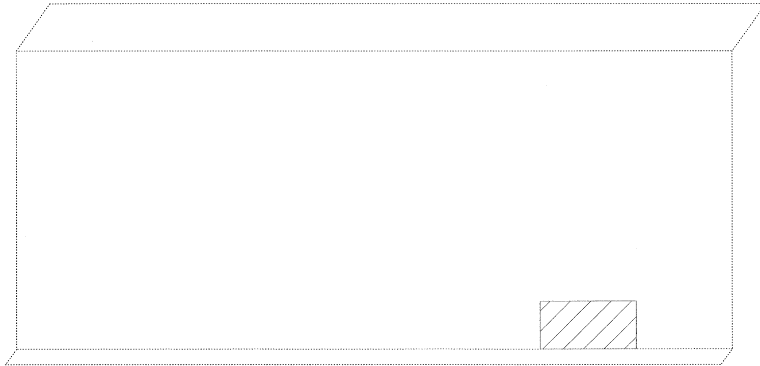
WEST SLOPE WALL