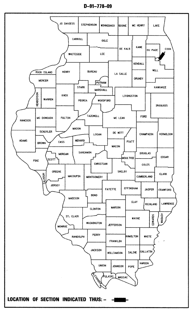
LOCATION OF SECTION INDICATED THIS: - [shaded area]

Ciorba Group, Inc. DESIGN FIRM REGISTRATION NUMBER 184-001016 CONSULTING ENGINEERS SUITE 402, 5507 NORTH CUMBERLAND AVE CHICAGO, ILLINOIS 60656 ☎ (773) 775-4009