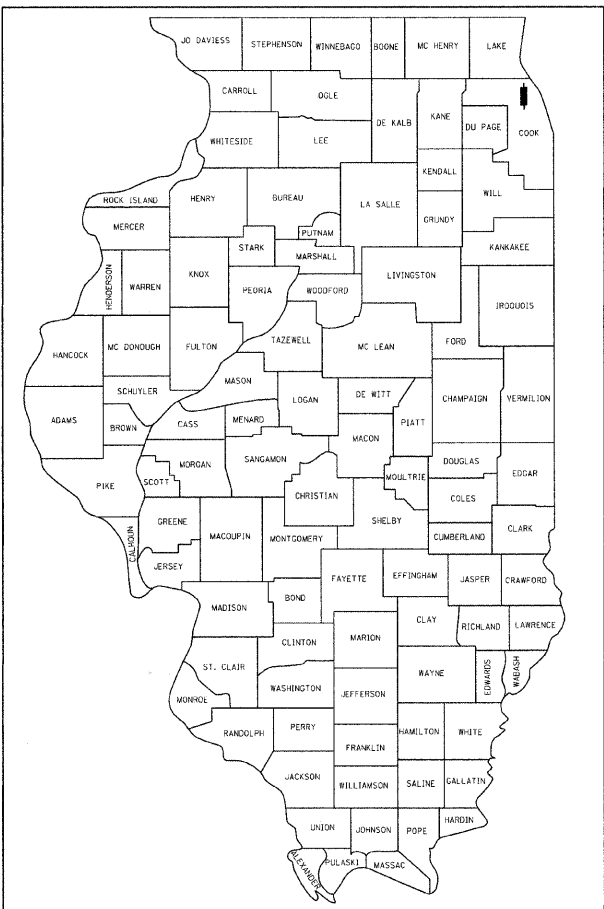
LOCATION OF SECTION INDICATED THUS: [Symbol]

PROJECT NUMBER: ARA-9003(547) F.A.P. ROUTE 350 U.S. ROUTE 41 (SKOKIE BOULEVARD) BEGIN STREETSCAPE IMPROVEMENTS STA. 10 + 32